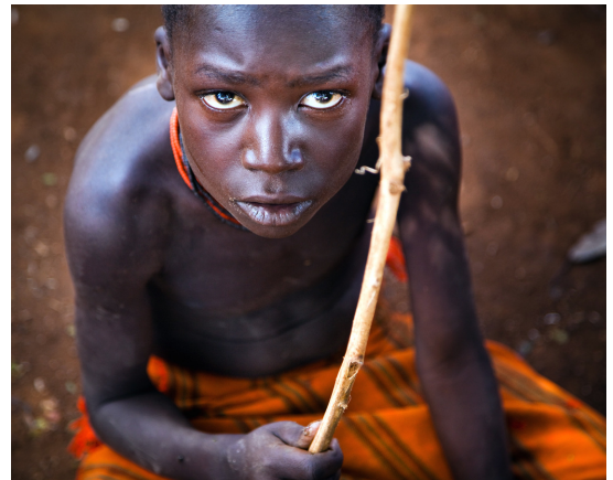
Thirsting for Education